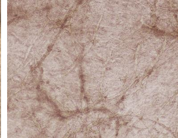
haMVs cultured in 3D collagen (3 mg/ml) for 10 days after seeding with 100,000 microvessels/ml (40X).