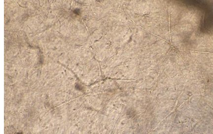
haMVs cultured in 3D collagen (3 mg/ml) for 10 days after seeding with 100,000 microvessels/ml (20X).